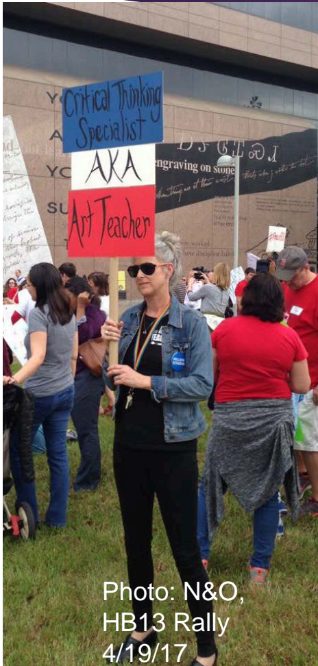
HB13 Rally 4/19/17